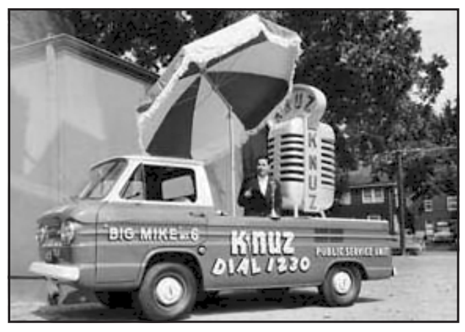
Promotional Rampside for KNUZ radio in Houston